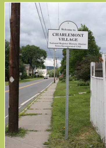
Charlemont Village Historic District Sign in Charlemont