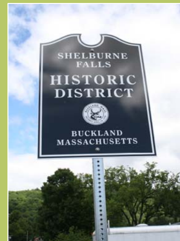
Shelburne Falls Historic District Sign in Buckland