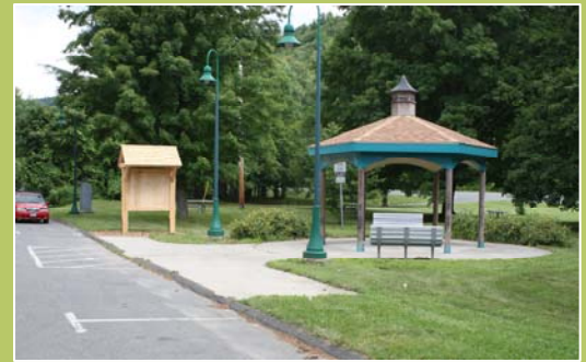
New Kiosk installed at the Shunpike Rest Area in West Charlemont