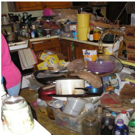
An example of what a Hoarding case would look like