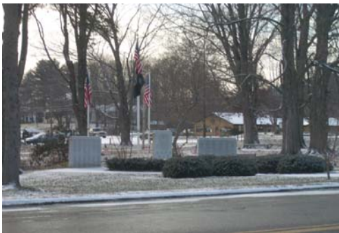
Bernardston Village Center