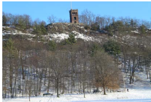
Poet Seat Tower in Rocky Mountain area of Greenfield