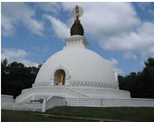
Peace Pagoda in Leverett