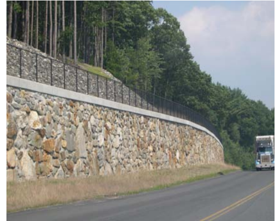
Route 2 in Erving

At its January meeting the FRCOG Council adopted the 2011 budget. The assessment paid by member towns, known as the Regional Services Assessment, has been level funded for 2011. The assessment was cut by 10% last year and has been reduced by a total of 9.3% since 2001. The Council's Finance Committee recommended a level funded budget to the Council, in part, to prepare for the expected increased costs the FRCOG will face in Fiscal Year 2012 when staff offices are moved into the Franklin Regional Transit Center. While the total assessment has been level-funded, each town will see a small increase or decrease because Equalized Values (EQVs) have changed. EQV is the total property value of a community as certified by the MA Department Revenue and is part of the formula used to calculate the FRCOG assessment. Budgets and additional information will be sent to all member towns later this week.