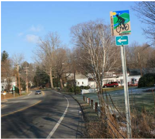
Franklin County Bikeway Logo and Directional Signs installed in Greenfield

The Franklin Regional Council of Governments is pleased to announce that Franklin County Bikeway logo and directional signs have been installed along the approximately 44-mile central section of the shared roadway portion of the Franklin County Bikeway. The Franklin County Bikeway is a regional bicycling network that travels through eight towns in Franklin County. This bicycle network consists of both off-road and shared roadway facilities, and provides access to employment, educational, cultural and recreational sites. The Bikeway travels through the towns of Deerfield, Erving, Gill, Greenfield, Leverett, Montague, Northfield, and Sunderland. These routes are depicted on the 2009 Franklin County Bikeway Map .