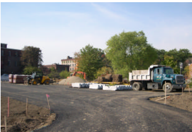
Construction of the parking area for the Riverfront Park