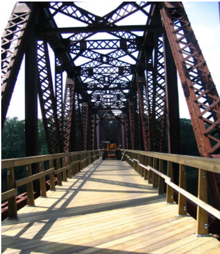
A view of the former railroad bridge over the Connecticut River that is being reconstructed for trail users as a part of the Canalside Trail Bicycle Path Project.

Northern Construction Services of Weymouth, Massachusetts has been hard at work during this past construction season rehabilitating two former rail bridges along the Canalside Trail Bicycle Path. This work is being completed as part of the construction of the southern section of the Canalside Trail Bicycle Path, the portion of the path that travels from Montague City Road to McClelland Farm Road in East Deerfield. When completed, trail users will get a spectacular view of the Connecticut River from the bridge. The work on this portion of the project is scheduled to be completion in 2007.