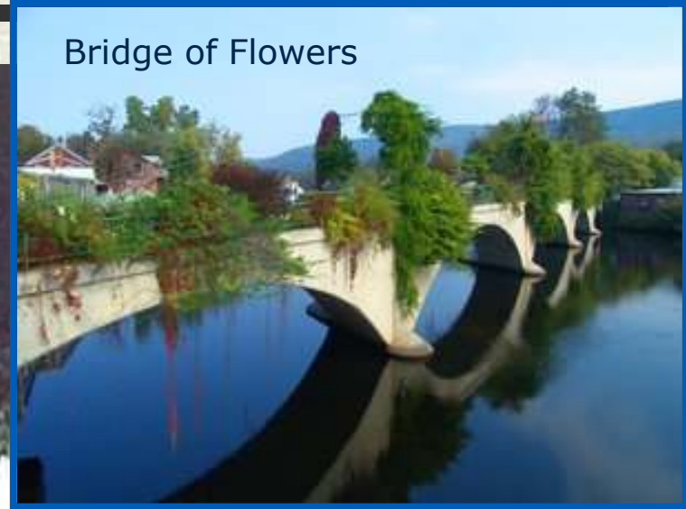
Bridge of Flowers