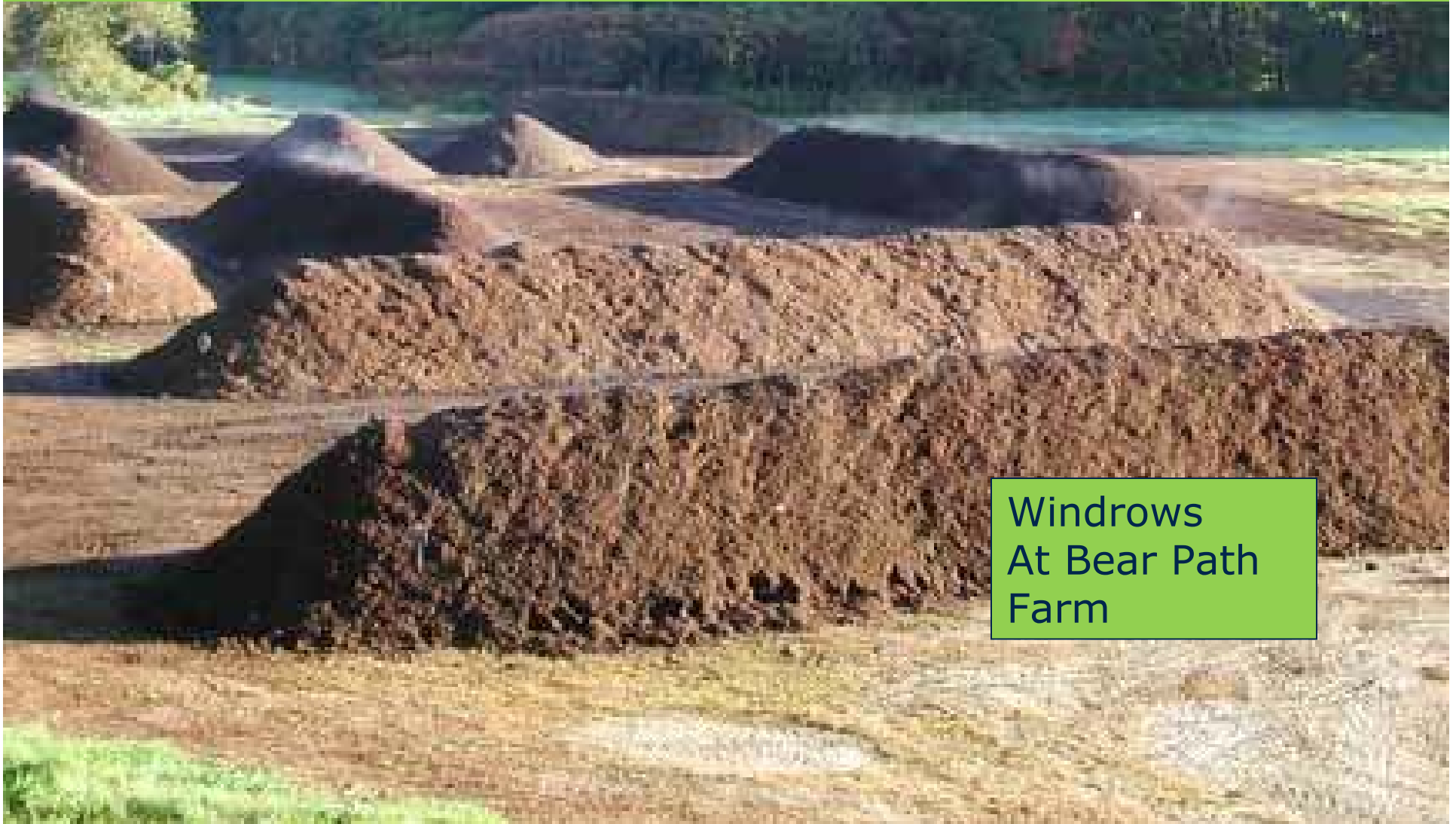
Windrows At Bear Path Farm