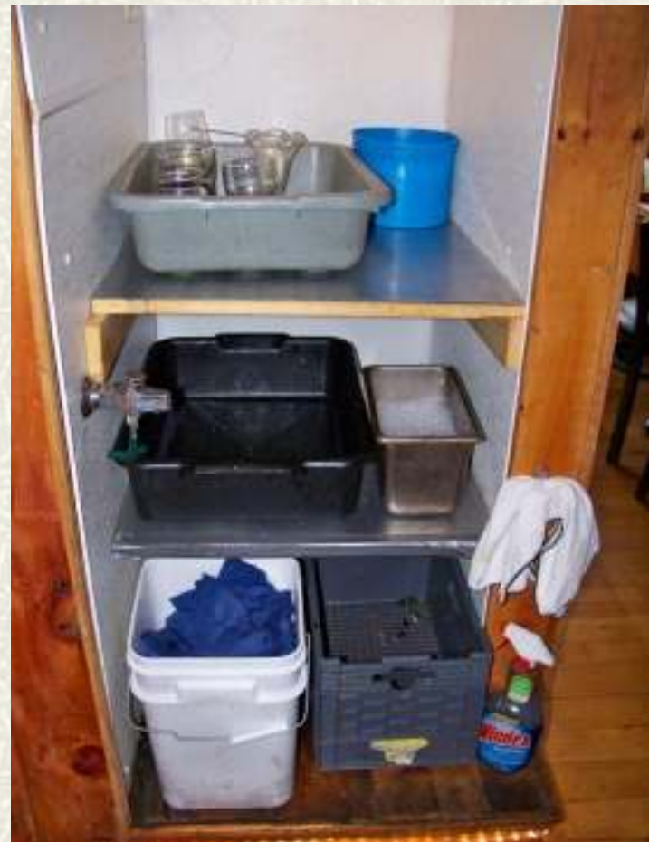
Pictured: West End Pub table bussing area