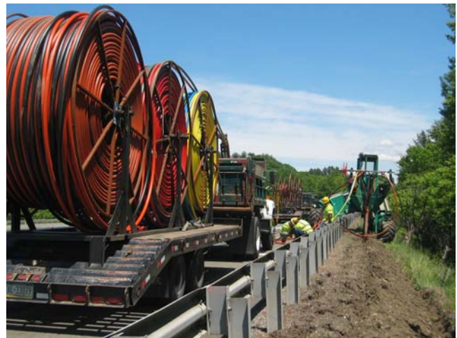
Installation of ITS Infrastructure along I-91

The MBI will construct a fiber-optic, middle mile network throughout western and north central Massachusetts. Using a federal American Recovery and Reinvestment Act (ARRA) award of $45.4 million plus $26.2 million of their Incentive Fund, the MBI will deploy over 1,100 miles of fiber optics through 123 municipalities within three years. The first segment of this middle mile network has already been constructed along the I-91 corridor. The I-91 segment was deployed in coordination with the Massachusetts Department of Transportation, and has been cited as a national model for government collaboration to deploy infrastructure.