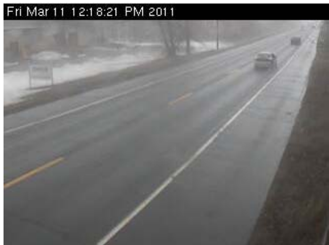
RTIC Webcam Screenshot – Route 116 Deerfield, near Route 5 & 10, facing West

Counties, the North Quabbin Portion of Worcester County, and the Springfield area of Hampden County. Its primary goals are to develop, deploy, and maintain an expanded RTIC website that includes real-time traveler information on local roadways, bus locations, congestion and construction, and to support regional economic development initiatives including tourism marketing. The RTIC Advisory Committee includes regional stakeholders, like the FRCOG, in addition to its state and federal partners.