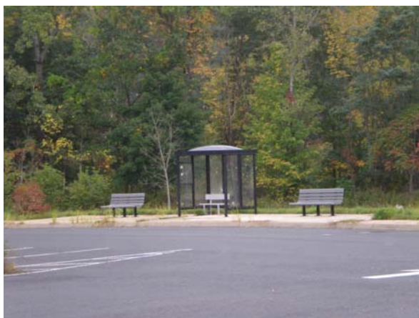
Charlemont MassDOT Park and Ride

Park and ride lots provide an opportunity to those who do not live on or within walking distance of public transit routes to travel to an intermediary location and take public transportation or carpool with other commuters. There is currently a park and ride lot on Route 2 in Charlemont which was established by MassDOT in 2002. MassDOT is currently in the process of establishing a park and ride lot in the Town of Whately, which will be easily accessible to Routes 5/10, Route 116, and Interstate 91. The lot can be serviced by both the FRTA and the PVTa bus systems. It is currently under design and $1.2 million has been earmarked in CMAQ funds for its construction in the 2011 Transportation Improvement Program.