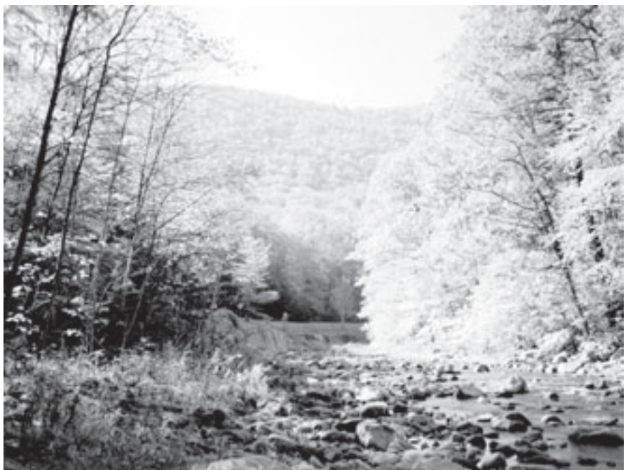
A scenic view of the Cold River in Charlemont

This very short segment has an historic cemetery (the East Charlemont Cemetery) and a church. There are views of the river to the south of the road.