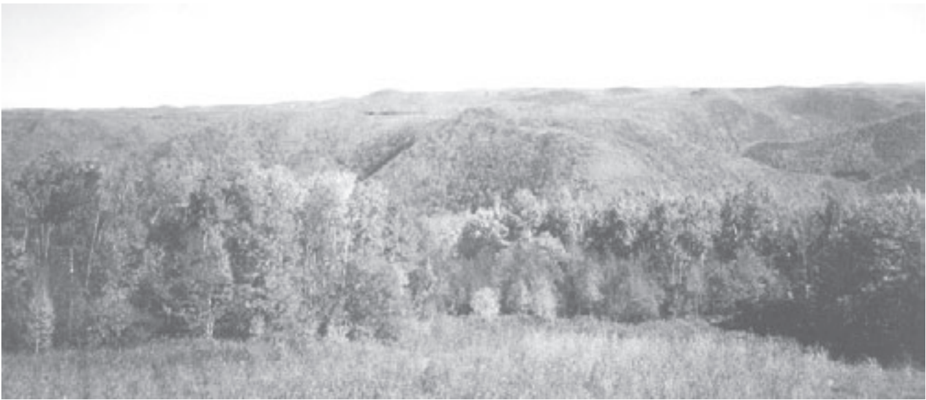
View from the Eastern Summit, looking northeast.

a continuation of visual segment 23A as it continues from east to west into Berkshire County. This segment is located entirely within the Mohawk Trail State Forest, including the entire 1.7-mile section through the town of Savoy. This segment of the Byway is extremely scenic in all seasons, but it especially shines during the fall foliage season.