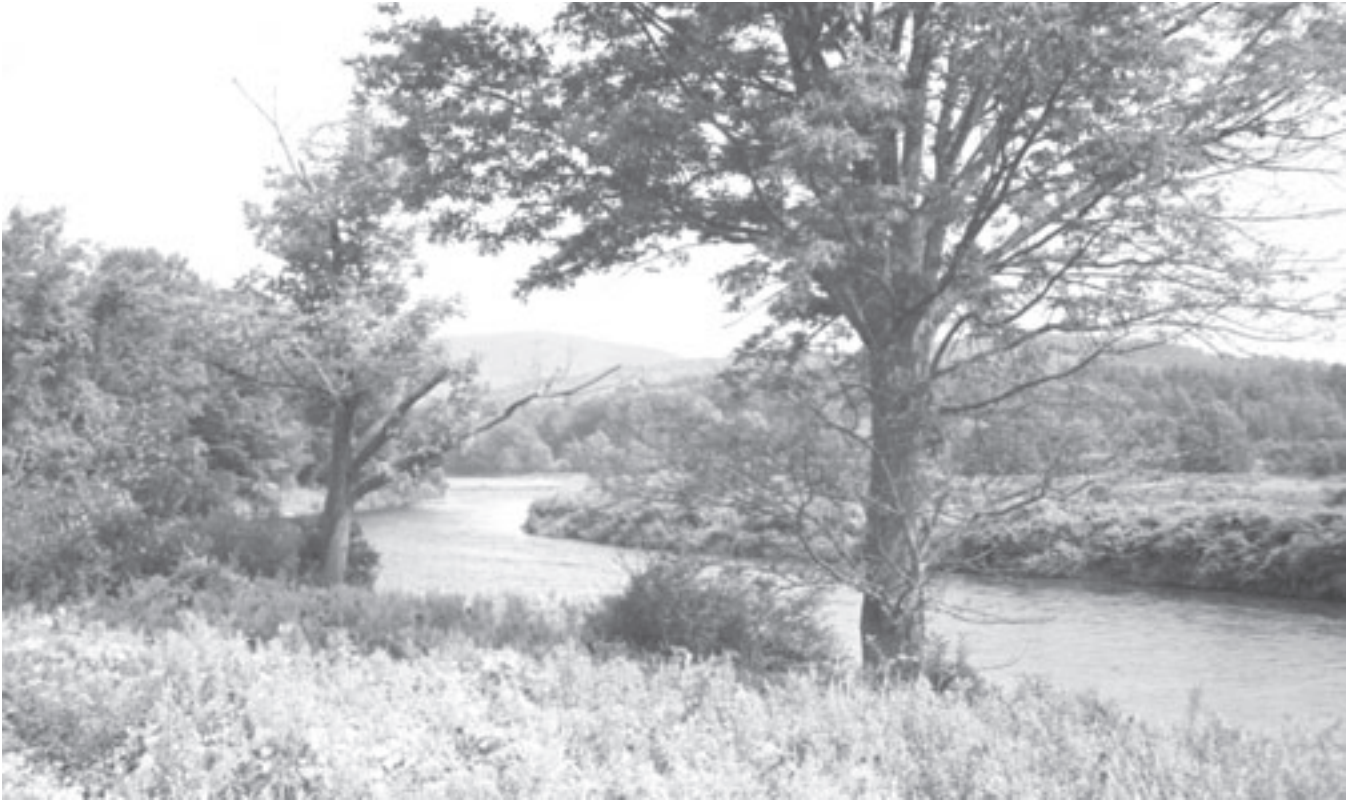
A spectacular view of the Deerfield River.