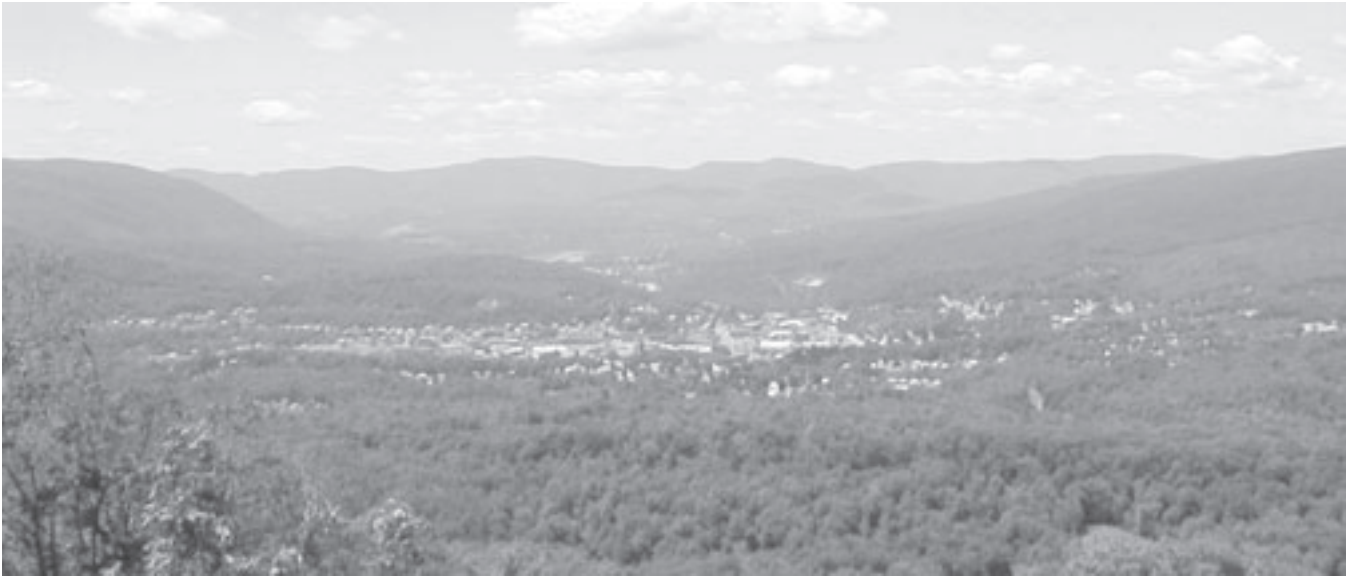
View from the Western Summit, looking west.

Hampshire. Also visible from the summit is Upper Bear Swamp Reservoir and an old landslide scar from the 1938 hurricane. The summit itself includes a gift shop and some abandoned motel units.