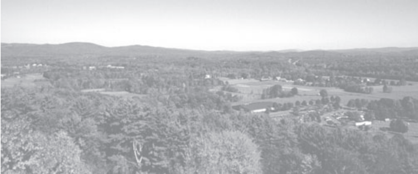
A view of Greenfield and beyond from the Mohawk Trail Scenic Byway at the Long View Tower.