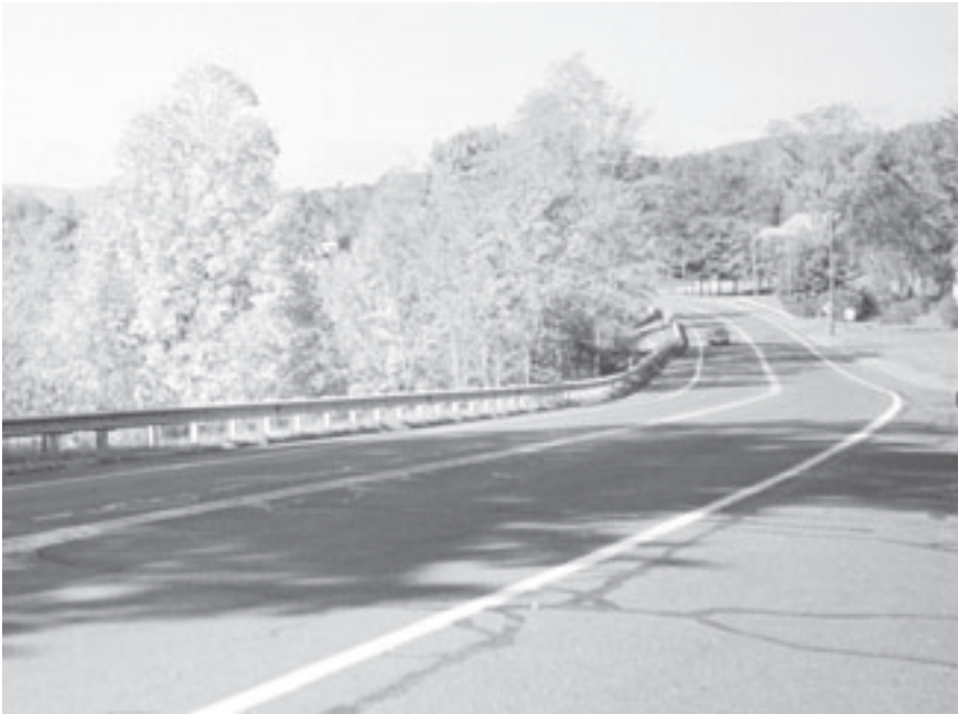
Overgrown trees block the scenic views of the Deerfield River along the Byway in Charlemont.