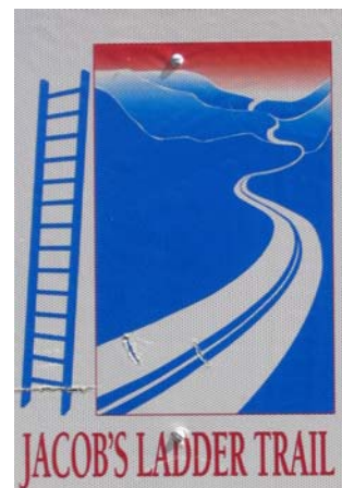
Way-finding sign approved for nearby Jacob's Ladder Trail.

The Jacob's Ladder Scenic Byway received approval to locate way-finding signs along the Jacob's Ladder Scenic Byway. The committee submitted a letter requesting way-finding signage along that byway along with an example of the type of signage desired (see picture at right). MassHighway District 1 approved the way-finding signs to